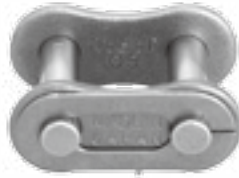
Closed type clip