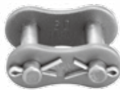
Split Pin (Cotter) type (KCM80~KCM200)