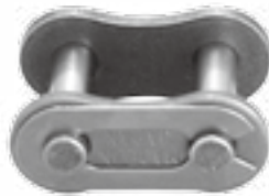
Open type clip