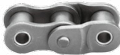
Two pitch offset link (For KCM25, KCM03, KCM04, and KCM05B, only two-pitch offset links are available. )