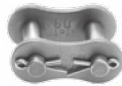
Split pin type (KCM80~KCM200)