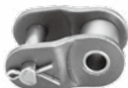
One pitch offset link